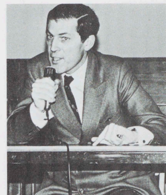
Philippe de Montebello