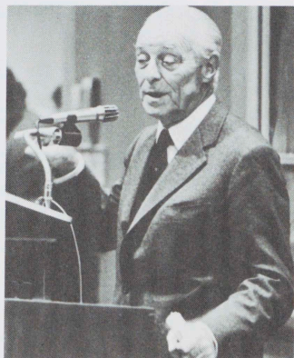
Baron Guy de Rothschild